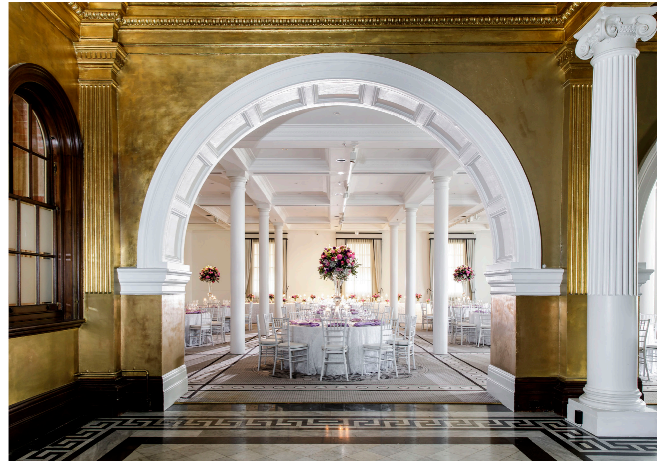
The Hermitage Room

Please note, this package has been designed for a maximum of 100 guests. A $15 surcharge per person will be applicable for ceremonies over 100 guests.